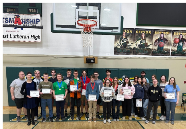
The Academic Challenge team took 1st place at Sectionals, and are moving on to the State competition!