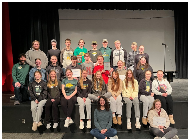
The Academic Challenge team recently won first place at the Regional Competition. Way to go, Knights!

Trinity Lutheran Church is hosting the Concordia University, Nebraska Chamber Choir on Saturday, February 22 at 1:00 pm at 600 Water St., Edwardsville. This 14-voice choir will be singing a diverse repertoire of sacred and secular choral music.